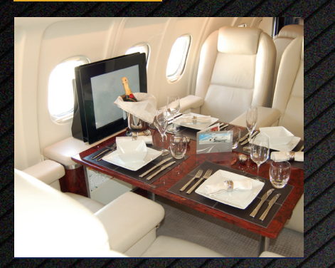
Private Aircraft Passenager

Covers bodliy injury or death due to accident while traveling as a passenger on a private aircraft.