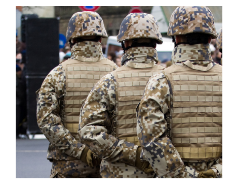
War & Terrorism Coverage

Covers accidental death & dismemberment caused by natural disasters.